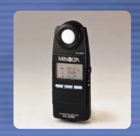
Chroma Meter CL-200