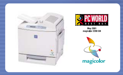
magicolor 2200 GN