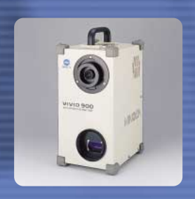
Non-Contact 3D Digitizer VIVID 900

To maintain and improve the quality of their products, industries demand highly precise sensing technologies. To meet those demands, Minolta supports industries—including entertainment and medical industries—with our sensing and image processing technologies for such diverse fields as light, color, temperature, display, 3D digitizing, and medical support.