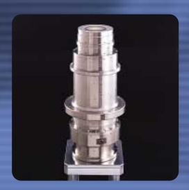
Lense for Stepper

Minolta, with its advanced optical technologies, contributes greatly to the progress of this field by creating unique, value-added optical devices and components and applying them to a wide variety of products.