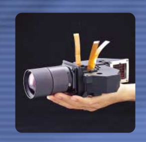
Optical Unit for LCD Projectors