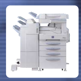
DiALTA Color CF9001